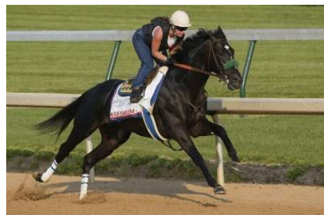
War Emblem Breezing

The Thoroughbred Corp.'s War Emblem (Our Emblem) completed his major preparation for his Triple Crown bid with a five-eighths work at Churchill Downs yesterday morning. The nearly black colt covered the distance in 1:01, galloping out in 1:14. "It was nice," said trainer Bob Baffert. "I was a little bit worried about the heat, but it looked like he was still full of himself. We didn't let him gallop out too strong." Baffert will saddle