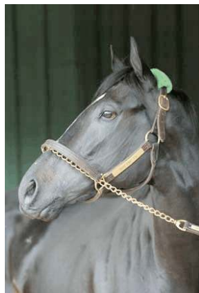
War Emblem