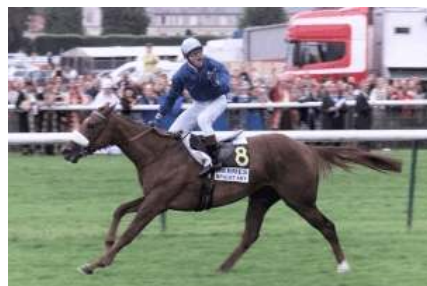
Bright Sky wins French Oaks

Bright Sky (Ire) (Wolfhound) went from TDN "Dark Horse" to Classic winner, taking yesterday's G1 Prix de Diane Hermes at Chantilly by two lengths over Dance