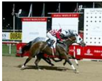
Caller One in Dubai