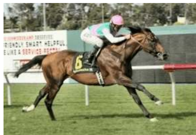
Skipping Wins at Hollywood

Hollywood Park's Barn 70 North once housed the horses trained by Charlie Whittingham. The barn is now home to trainer Bobby Frankel, who has a trio of runners entered in the GI Charles Whittingham H. at Hollywood this afternoon. Juddmonte Farms homebred Skipping (GB) (Rainbow Quest), winner of the 1 1/2-mile Jim Murray Memorial H. over the Hollywood turf last time out May 19, heads