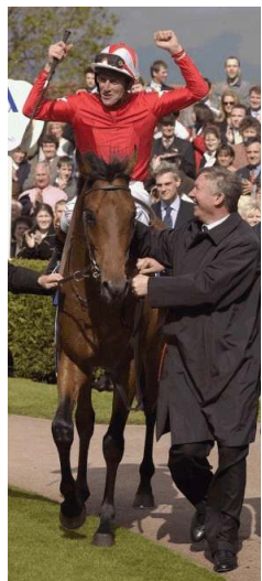
"Rock" & Murtagh at Newmarket