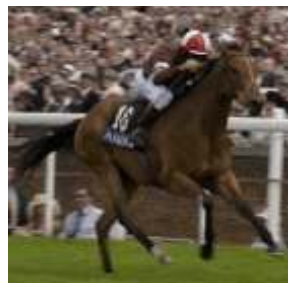
A historic win for Pat Eddery in the Queen Mary