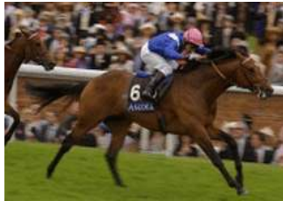
Malhub scores the upset

"It's very possible he won't run again." Those were part of the post-race comments from Ballydoyle trainer Aidan O'Brien after Johannesburg (Hennessy) finished a well-beaten ninth in yesterday's G1 Golden Jubilee S. on the closing program of the Royal Ascot meeting.