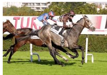
Act One at Saint-Cloud