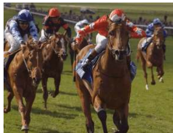
Rock Of Gibraltar

Trainer Aidan O'Brien has virtually ruled out a drop back in trip for Rock Of Gibraltar (Ire) (Danehill) in the G1 July Cup at Newmarket July 11. Despite his quote of 5-2 for the six-furlong sprint by Coral Eurobet, the colt will make his next start in the G1 Sussex S. July 31. O'Brien yesterday confirmed to Irish Racing online that Rock Of Gibraltar's attempt at a