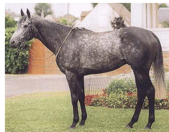
Kaldounevees

unit of currency throughout much of Europe. In fact, the euro (€) is now worth pretty much the same as a U.S. dollar, so you will realise that the French-based Kaldounevees, who this year commanded a fee of only €8,000, is an unlikely candidate to sire two Group 1 winners in a matter of