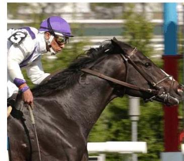
Pyrus wins Fort Marcy