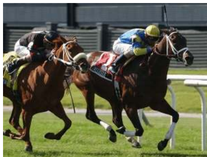
Tweedside takes Sheepshead Bay

It may be the Fourth of July, but the field for today's GII New York H. has a decidedly international flavor, with five of the eight entrants having been foaled overseas. The most accomplished of these is Janet (GB) (Emperor Jones), who is hoping that her third trip East