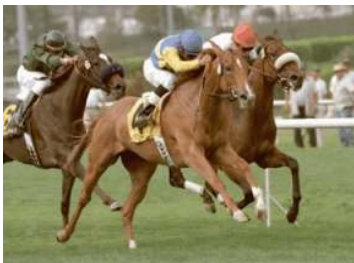
Megahertz (outside) wins Honeymoon