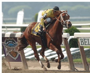
Gygistar at Belmont Park