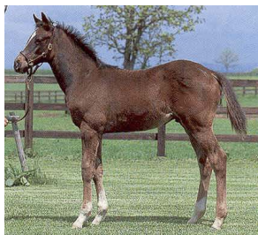
Sale topper Hip 130