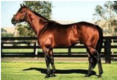
End Sweep

End Sweep (Forty Niner--Broom Dance, by Dance Spell), America's champion freshman sire of 1998, was euthanized Thursday at Shadai Farm in Japan. The 11-year-old stallion suffered an injury to his withers last month and it was announced Tuesday that End Sweep would not shuttle to Arrowfield Stud in Australia for the southern hemisphere breeding season. His condition