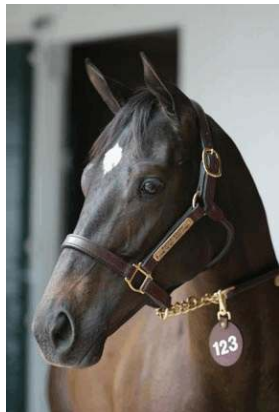
Hip 123 Seeking the Gold-- Desert Stormer colt