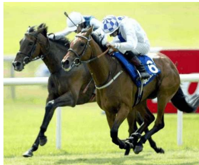
Margarula (outside) lands Irish Oaks