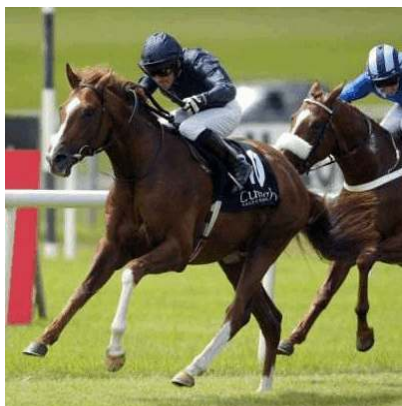
Van Nistelrooy

$6.4-MILLION YEARLING WINS DEBUT The highest-priced yearling of 2001, Van Nistelrooy (Storm Cat) got his career off to the best possible start when he captured his career debut, a seven-furlong maiden at The Curragh yesterday afternoon. The flashy chestnut