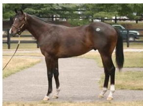
Hip 26