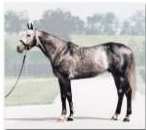
Unbridled's Song