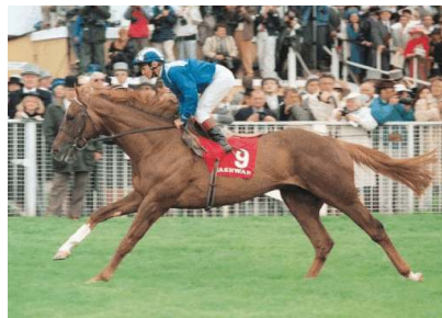
Nashwan prior to the Epsom Derby

One of the finest racehorses of the 1980s, Nashwan (Blushing Groom {Fr}--Height of Fashion {Fr}, by Bustino {GB}) was euthanized Friday evening after complications arose following minor surgery on his right hind leg. The 16-year-old stallion had been standing at Shadwell Nunnery Stud in Norfolk, England; his elder