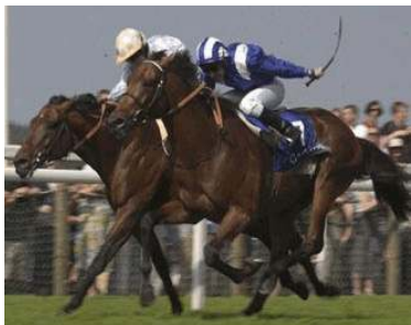
Golan (inside) defeats Nayef

Just five days after the death of his owner Lord Weinstock, Golan (Ire) (Spectrum {Ire}) responded to jockey Kieren Fallon's drive to deny Nayef (Gulch) by a head in a thrilling climax to yesterday's G1 King George VI & Queen Elizabeth Diamond S. at Ascot. "You need the horse and you need the team and we've had a tremendous team behind this horse," said trainer Sir Michael Stoute. "I'm thrilled, but it is also a very sad moment--Lord Weinstock would have loved this occasion because he fell in love with this horse. He was looking forward to seeing this horse in training as a four-year-old. This is a tribute to him as this is what they stood for--breeding top-class horses for the great European races." King George cont., p2