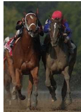
You (inside) takes Test Horsephotos