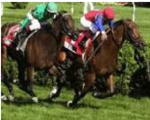
Nunatall defeats Guana

Nunatall (GB) (Night Shift) placed in her American debut in Santa Anita's mile Blue Northerner S. Jan. 9 before a pair of out-of-the-money finishes in subsequent stakes starts over the Santa Anita turf in March. The filly was then given a two-month freshener, resurfacing in the GIII Seniorita S. at Hollywood May 4 where she was third. Solidly backed following an easy win last