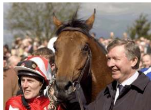
"Rock" After Sagitta 2000

When Rock Of Gibraltar (Ire) (Danehill) beat stable companion Landseer (GB) by 1 3/4 lengths in the G1 St James's Palace S. at Royal Ascot June 18, he became