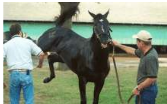
War Emblem Kicks Up his Heels at Monmouth