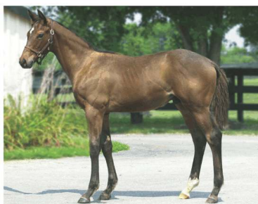
Colt out of Watercolourtwo