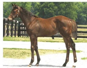
Filly out of MAKETHEMOSTOFIT