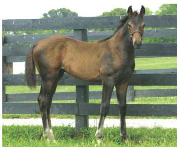
Colt out of FOR DIXIE