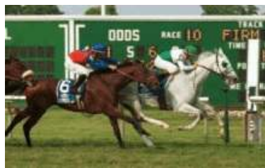
With Anticipation holds off Denon at Monmouth

Seven-year-old With Anticipation (Relaunch) and eight-year-old Cetewayo (His Majesty) have a chance to give their contemporaries (seven-year-olds and older) their 16th Graded stakes win with a victory in this afternoon's GI Sword Dancer Invitational H. at Saratoga. With Anticipation comes off a neck victory in