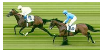
Wellbeing Beats Sakhee Photo Finish