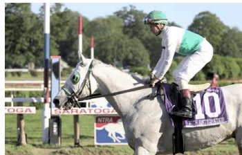
With Anticipation and Pat Day

The Pat Day watch has ended. With his victory aboard With Anticipation (Relaunch) in yesterday's GI Sword Dancer Invitational H. at Saratoga, the Hall of Famer became the all-time leading money-winning rider with $264,580,968 in earnings, breaking the mark of $264,351,679 that has been held by Chris McCarron since he retired in June. "I would like to thank the thousands of horses that got me here," Day said. "I would