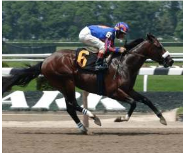
Zavata