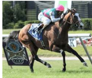
Beat Hollow takes Manhattan

This year's renewal of the GI Arlington Million features another global cast--four of the nine runners are from overseas--but the focus this time is squarely on the American contingent. Considered by many to be the top turf horse in the U.S., Beat Hollow (GB) (Sadler's Wells) has suffered two defeats at the hands of Sarafan