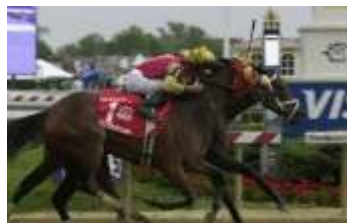
Summer Colony noses out Dancethruthedawn at Pimlico

When last they locked horns, Summer Colony (Summer Squall) and Dancethruthedawn (Mr. Prospector) dueled the length of the stretch in the May 17 GIII Pimlico Breeders Cup Distaff H., the former asserting in the waning strides along the inside for a nose success. The two four-year-olds, widely regarded as the two