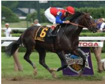
Medaglia d'Oro takes Jim Dandy