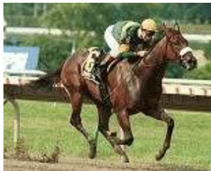
Forever Partners wins Colleen