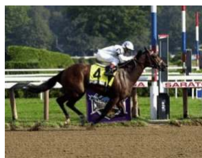
Awesome Humor wins the Adirondack