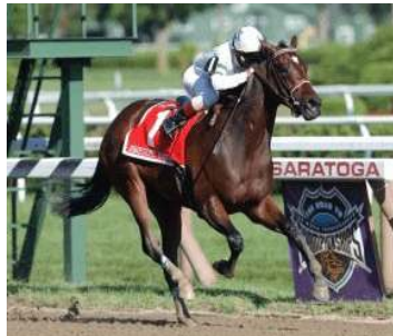
Awesome Humor takes Spinaway

Awesome Humor (Distorted Humor) is a serious filly. Unbeaten in three previous starts, including victories in the GII Adirondack and the GIII Debutante S., she was nevertheless sent off as the 3-1 third choice to the 2-1 favorite, Jersey shipper Forever Partners (Not for Love).