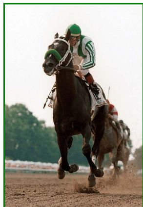
War Emblem wins Haskell