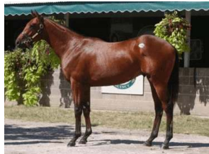
Hip 1150