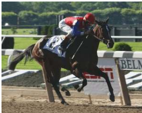
You

the GI Test S. before finishing a creditable third in the GI Alabama S. Aug. 17. "The Alabama was a little longer, but she stayed on," said trainer Bobby Frankel, who had thought about giving his charge some time off following that effort. "I think she'll fit in very well [here]." If a speed duel develops, Shine Again and Minister's Baby (Deputy Minister) could be the beneficiaries. The latter has done her best running at routes and comes into her Grade I debut off a victory in the GIII Gardenia H. going nine panels at Ellis Park.