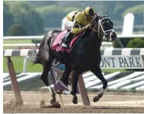
Raging Fever

There may be only five fillies entered in the GI Ruffian H. this afternoon at Belmont, but three of them are already Grade I winners and the other two are graded-stakes winners. Raging Fever (Storm Cat) and You (You and I) have each won Grade I events over course and distance and will be tough once again. Raging Fever took the 2000 GI Frizette and has been stronger than ever at four, winning the GI Ogden Phipps H. June 22. She missed by just a half-length to Shine Again (Wild Again) in the GI Ballerina H. Aug. 25, tiring late after chasing