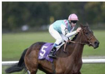
Banks Hill