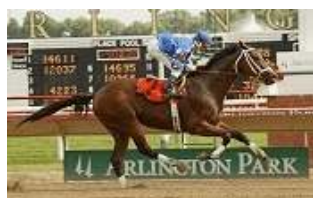
Bonapaw

A winner in four of his last five starts, Bonapaw (Sabona) looks for his fifth stakes win of the year in the GI Vosburgh at Belmont Park today. After winning a