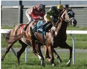
Finality

Finality (Dehere), second in four of his five previous stakes attempts, finally broke through with his first black-type score in the GII Jamaica H. at Belmont Park yesterday. The chestnut just missed in his latest, running second to Ibn Al Haitham (GB) (Zafonic) by a half-length in the Sept. 2 GIII Saranac H. at Saratoga. Enjoying a perfect trip this time, the New York-bred sat a tracking third as Union Place (Out of Place) cut out solid fractions, then drove past that gallant rival in the stretch to take it by a length. "He really likes Belmont," trainer Todd Pletcher said. "He got a good trip today and everything worked out smoothly." Added jockey John Velazquez, "We had some tough beats earlier in the year. Today he turned the tables on them. He really exploded when I asked him. No one could kick with him." Click here for the brisnet.com catalogue-style pedigree or the brisnet.com chart . For the video replay, choose broadband or modem .