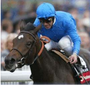
Kazzia