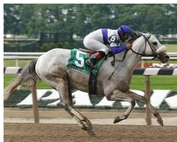
Swept Overboard Adam Coglianesse

Deals are soon scheduled to be completed to send 2001 Eclipse champion sprinter Squirtle Squirt (Marquetry) and millionaire Swept Overboard (End Sweep) to Japan. Last year's GI Breeders' Cup Sprint hero,