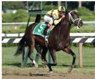
Summer Colony Horse Photos