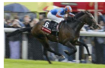
High Chaparral at Epsom