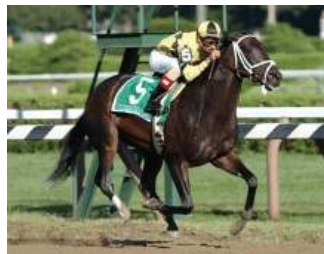
Summer Colony wins the Personal Ensign