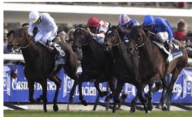
Marienbard (right) goes for the lead

Marienbard (Ire) (Caerleon), deputizing for last year's Arc hero Sakhee, belied his odds of 16-1 to give Godolphin its third renewal of the G1 Prix de l'Arc de Triomphe Lucien Barriere at Longchamp yesterday afternoon. The bay unleashed a powerful drive under Frankie Dettori inside the final furlong to overhaul