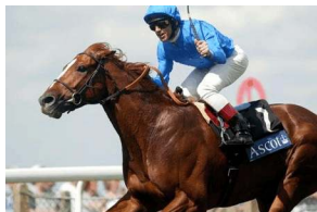
Goff's graduate Grandera

Hot on the heels of the strong Houghton Sale in Newmarket, Goffs today kick off their two-day Orby Sale, followed by Thursday's Challenge Sale, in the hope that the 408 lots on offer brings the returns witnessed there and at Doncaster and Fairyhouse last month. Just this year, Grandera (Ire) (Grand Lodge), Mail the Desert (Ire) (Desert Prince {Ire}), Margarula (Ire) (Doyoun {Ire}), Pearly Shells (GB) (Efisio {GB}) and Rebelline (Ire) (Robellino) have advertised the auction by winning at the highest level.