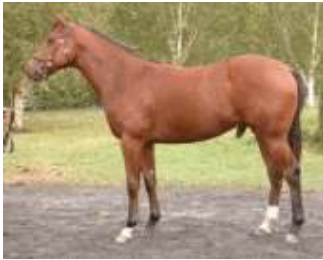
Hip 311

Dual-hemisphere stallion Danehill led the way on the final day of the Goffs Orby Sale when hip 311, a bay colt out of the unraced five-year-old mare Born Beautiful (Silver Deputy), topped the session with a €770,000 final bid from the British Bloodstock Agency's Anthony Stroud. Consigned by Lynn Lodge Stud, agent, the yearling hails from the family of French highweight juvenile filly Pas de Reponse; and Green