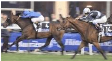
Marienbard Takes Arc

Godolphin's Marienbard (Ire) (Caerleon), the winner of Sunday's G1 Prix de l'Arc de Triomphe, looks likely to end his 2002 campaign in G1 Japan Cup at Nakayama Nov. 24. Trainer Saeed bin Suroor yesterday told Gulf News , "Hopefully, he can round off a great year...with another win in the Japan Cup. That will be fantastic and great for the team." Bin Suroor