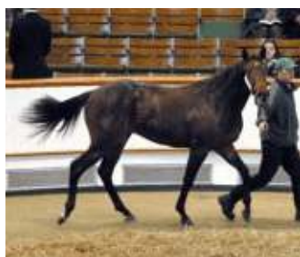
Lot 273