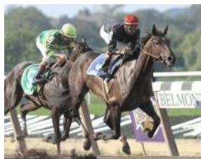
Storm Flag Flying

Rock of Gibraltar is one of two morning-line favorites at even-money, the other being the unbeaten Storm Flag Flying (Storm Cat), the headliner in the Long John Silver's Juvenile Fillies. Storm Flag Flying could be the first third-generation Breeders' Cup winner, but will have to overcome her temperment issues. "She has so much talent, but she can go ahead and do something dumb at any moment," said trainer Shug McGaughey. "She has acted as good as a horse can over the last week or so...[but] there is going to be a lot of attention on her [at Arlington] and she is liable to do just about anything."