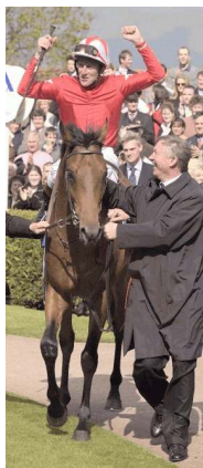
Rock of Gibraltar