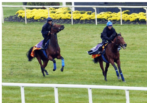
Islington (left) and Golan Having Fun